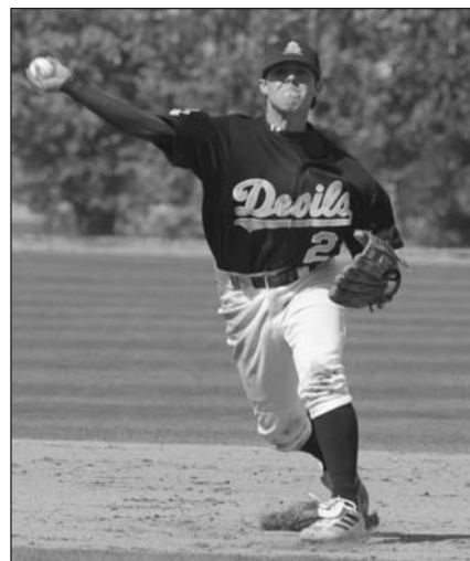
Dustin Pedroia 2003 Pac-10 Co-Player of the Year